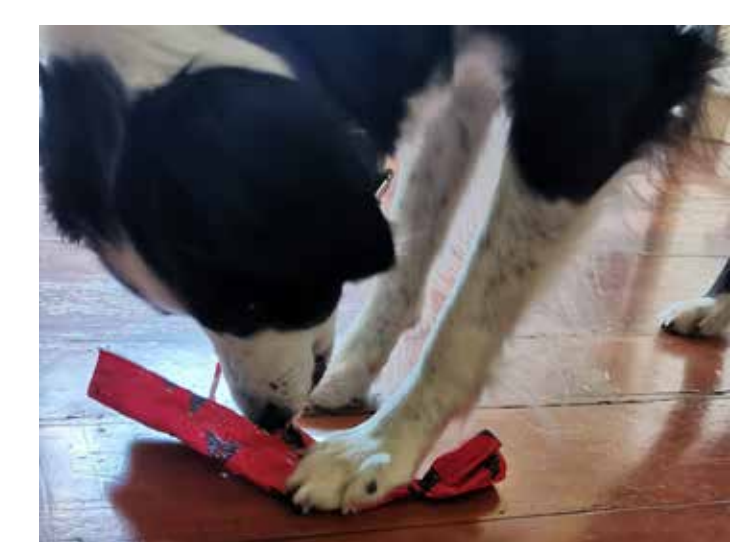
Step 4. Give the Christmas cracker to your dog! Keep an eye on them to make sure they don't try to eat the paper.

24 December 2021/January 2021 December 2021/January 2021