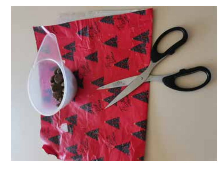
Step 1. Find some paper (it doesn't need to be Christmas paper if you want to use other paper) and some dog treats.