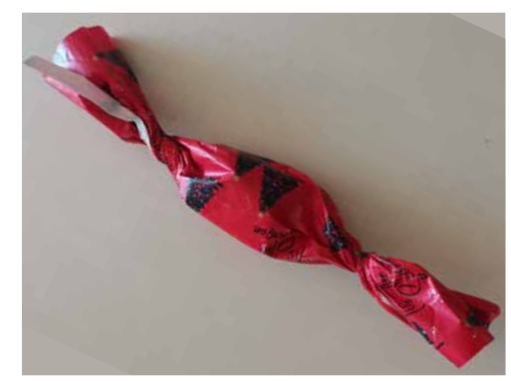
Step 3. Roll up the paper and twist the ends.