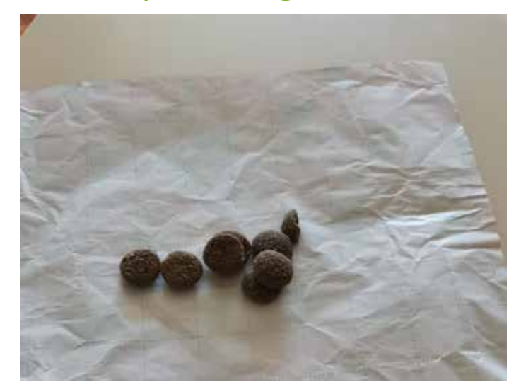
Step 2. Place a handful of dog food on the paper.